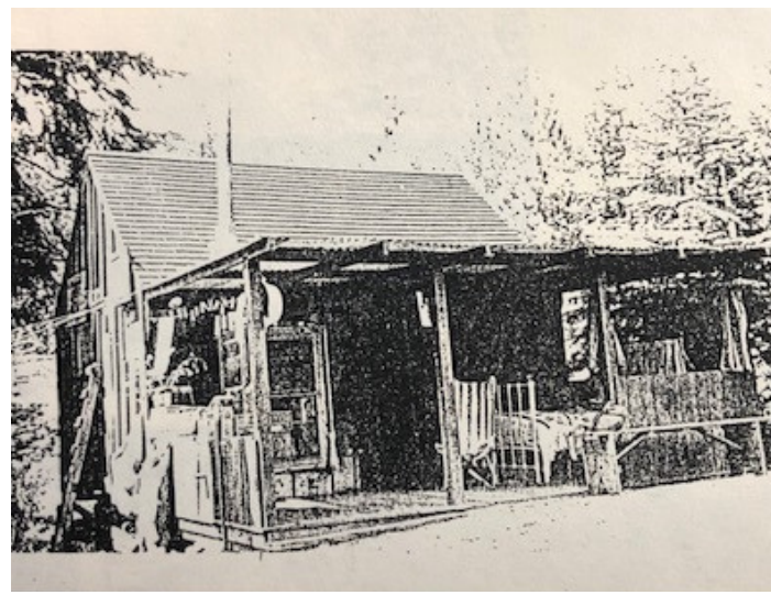
East side of cabin - photo taken in 1934