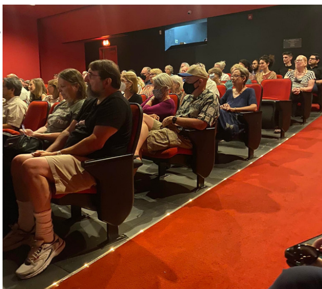
Right: Audience members in FAM Bonner Auditorium.