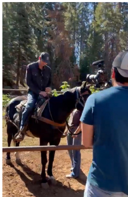
Filming at the Balch Park Pack Station