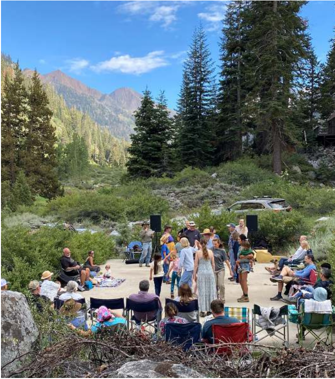
Music in the Mountains - Thanks to Mankin Creek for the great music!