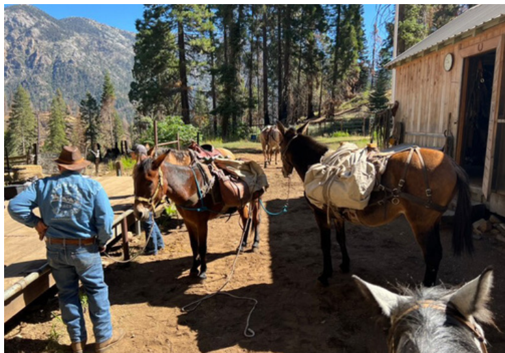
Filming at the Balch Park Pack Station

To watch the other videos we have made please visit our webpage: www.mineralking.org or scan the QR code below to be directed to our YouTube channel: