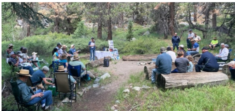
Picnic in the Park